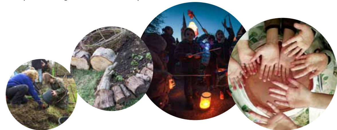
Rutland Home Education Group programme // Skills & Knowledge: Sailing, Archaeology, Ceramics, Wild Animal Stories, Discovery Art, Osprey Expert Day, Astronomy Talk, "Grubs Up!" Cooking Classes, Hedgerow Planting, Board Games, Scavenger Hunt. // Community Links: Rutland Radio, Oakham Fire Station, Rutland Poppy Project, 'Grow Together' Schools Plant Pot Project, Oakham Police Station, Tesco, Hambleton Bakery. // Long Projects: Castle Meadow, Key-hole Garden. // Crafternoons: Lantern Making, Marbelling, Wreath Making, Birdfeeders, Natural Inks, Seed Balls, Bug Hotels, Natural Dyes.

Seasonal rituals like the Winter lantern walk and Summer camping connects us to our environment and navigate the natural cycles and agricultural calendar year.