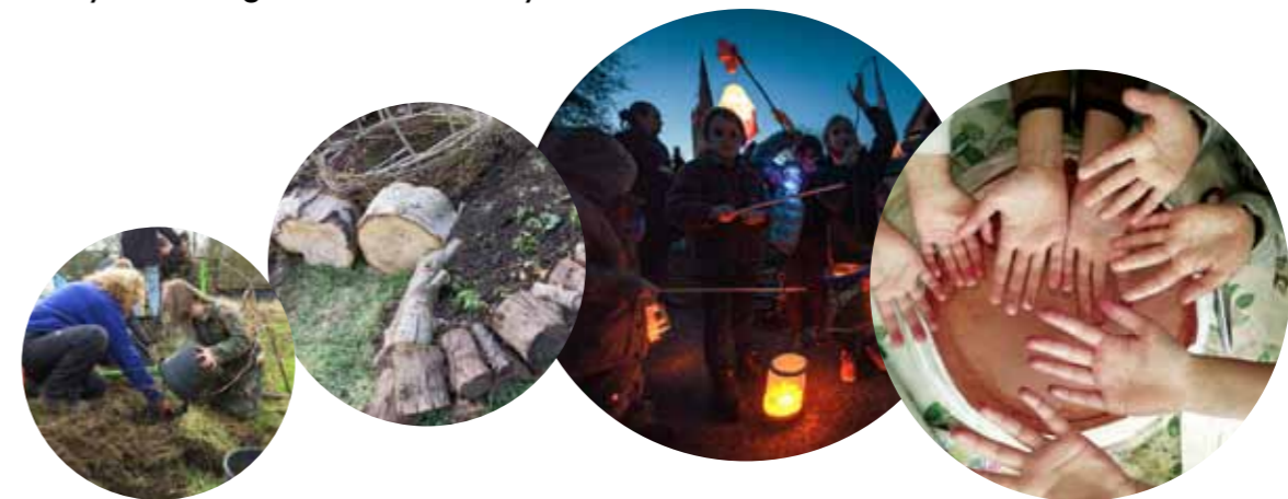
Rutland Home Education Group programme // Skills & Knowledge: Sailing, Archaeology, Ceramics, Wild Animal Stories, Discovery Art, Osprey Expert Day, Astronomy Talk, "Grubs Up!" Cooking Classes, Hedgerow Planting, Board Games, Scavenger Hunt. // Community Links: Rutland Radio, Oakham Fire Station, Rutland Poppy Project, 'Grow Together' Schools Plant Pot Project, Oakham Police Station, Tesco, Hambleton Bakery. // Long Projects: Castle Meadow, Key-hole Garden. // Crafternoons: Lantern Making, Marbelling, Wreath Making, Birdfeeders, Natural Inks, Seed Balls, Bug Hotels, Natural Dyes.

Seasonal rituals like the Winter lantern walk and Summer camping connects us to our environment and navigate the natural cycles and agricultural calendar year.